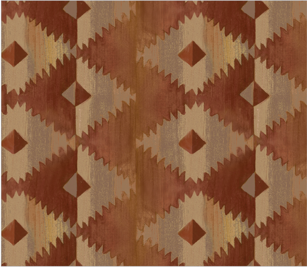
DP24385-34 | Cowboy Blanket | Rust Multi