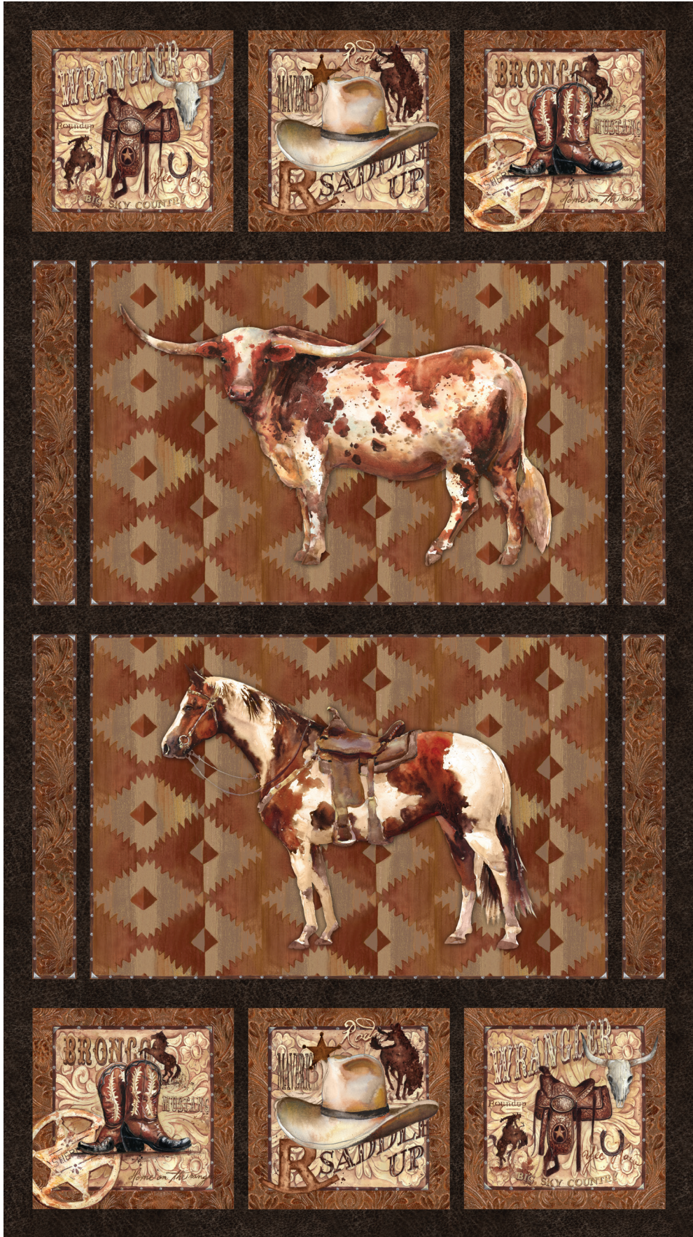
DP24382-36 | Cowboy Panel | Brown Multi