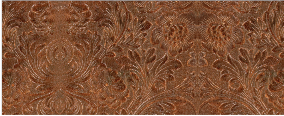
24391-34 | Tooled Leather | Rust