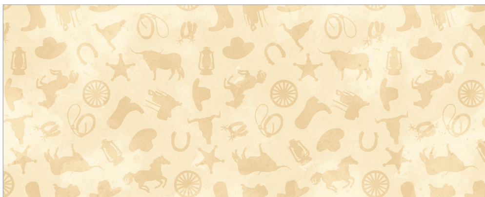
24389-12 | Cowboy Blender | Beige