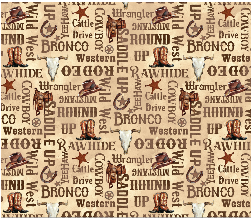
DP24384-14 | Cowboy Words | Beige Multi