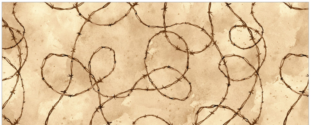
24387-14 | Barbed Wire | Beige/Brown