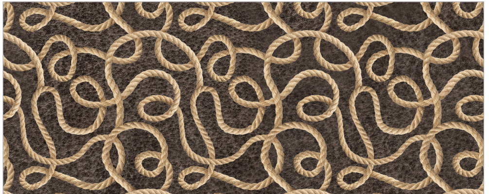
24388-35 | Lasso Tango | Brown/Beige