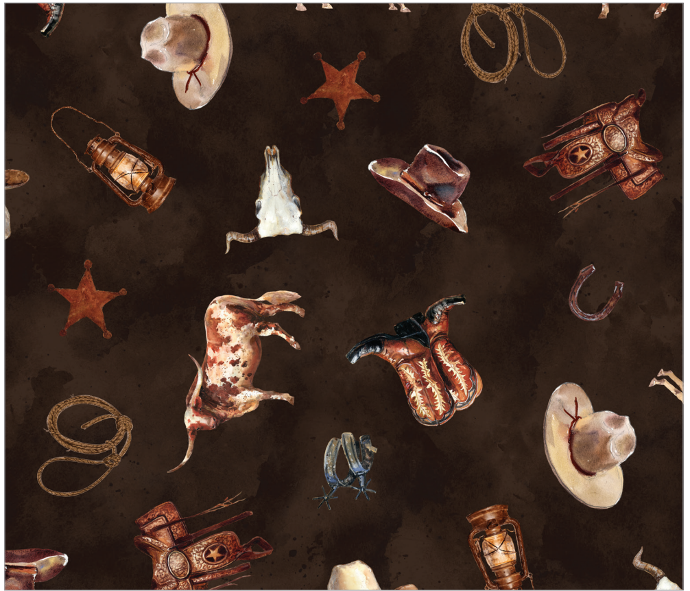
DP24383-36 | Cowboy Peraphernalia | Brown Multi