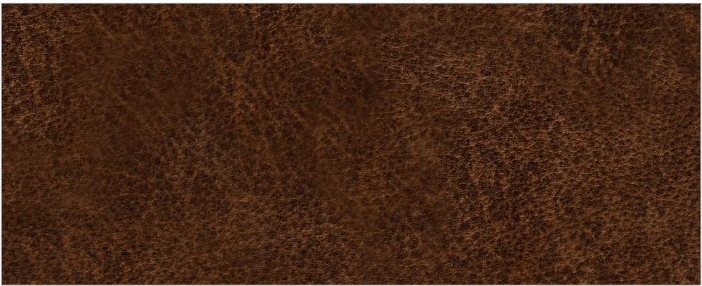
24390-34 | Leather | Rust