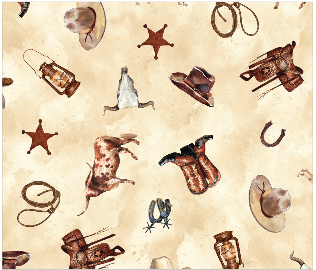
DP24383-12 | Cowboy Peraphernalia | Cream Multi